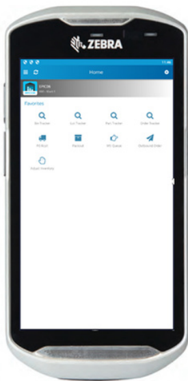
Epicor Mfg Wireless Warehouse application provides a modern and intuitive user experience